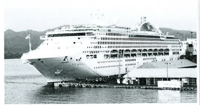
The cruise ship Sun Princess was built in 1995 and is operated by the Princess Cruises line, At the time of her construction, she was one of the largest cruise ships in the world, Contributed photo