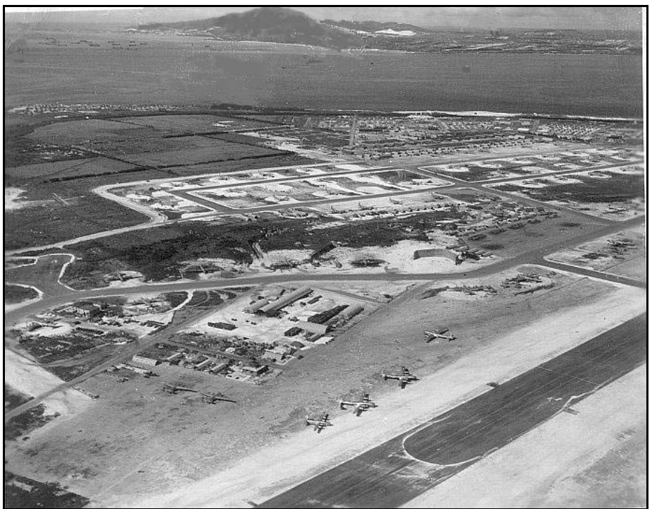
Figure 13.1-2. WWII Era Aerial View of North Field and Surrounding Facilities