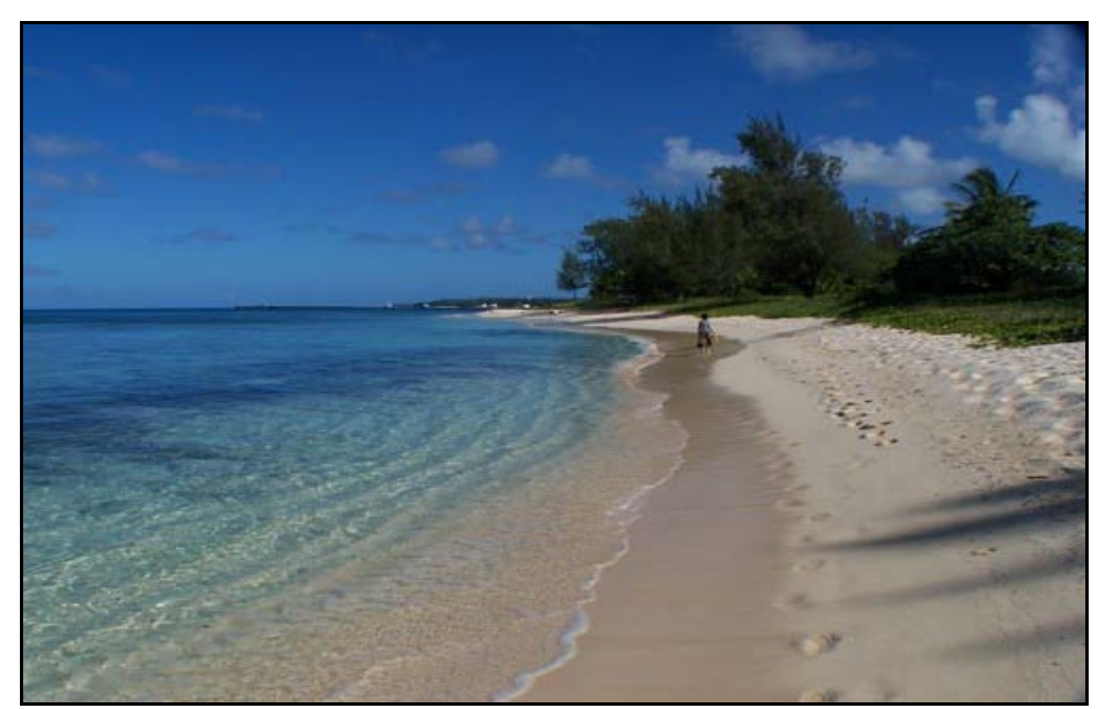
Figure 13.1-18. Taga Beach