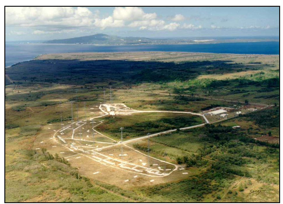
Figure 13.1-12. An Aerial View of the Voice of America, North Field, and Saipan in the Distance