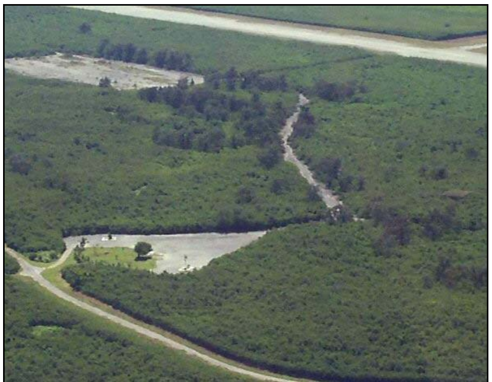
Figure 13.1-7. An Aerial View of the National Historic Landmark and Bomb Pit Enclosure (Lower Left Side of Photo)