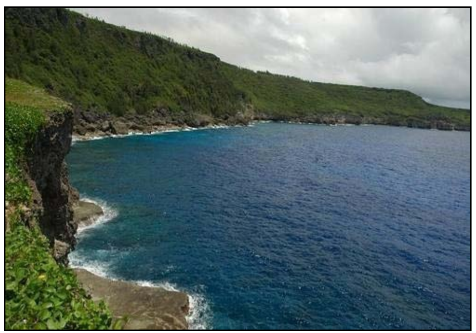
Figure 13.1-16. A View of the Southern Shoreline at Suicide Cliff

Suicide Cliff is located on the southeastern side of Tinian affording a view of the Pacific Ocean. The vertical cliff extrudes along the shoreline providing a fortification-like natural wall. This was the location where hundreds of Japanese soldiers and family members jumped to their deaths rather than be captured by U.S. soldiers. It is another one of Tinian's highly visited scenic viewpoints (Figure 13.1-16).