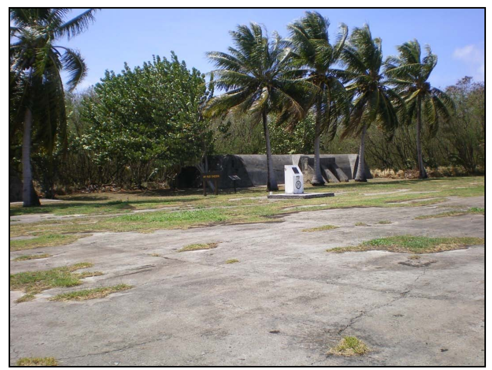
Figure 13.1-6. View of National Historic Landmark Marker and WWII Bunker at North Field

North Field is a National Historic Landmark and is listed on the National Register of Historic Places (Figure 13.1-6). The Atomic Bomb Pits in the North Field, where the bombs used on Nagasaki and Hiroshima, Japan, were loaded, became an important feature after WWII (Figure 13.1-7 and Figure 13.1-8). In addition, as shown in Figure 13.1-9, the Japanese Air Command Post at Ushi Airfield has been preserved and provides a cultural landscape feature with high visual quality. The North Field was a significant military platform designed and constructed with four runways, numerous taxiways and two service aprons. The area surrounding North Field was fully built out with supporting infrastructure and facilities. Though the field and surrounding facilities are now overgrown and abandoned, its historic significance remains and associated aesthetic value continues to draw visitors.