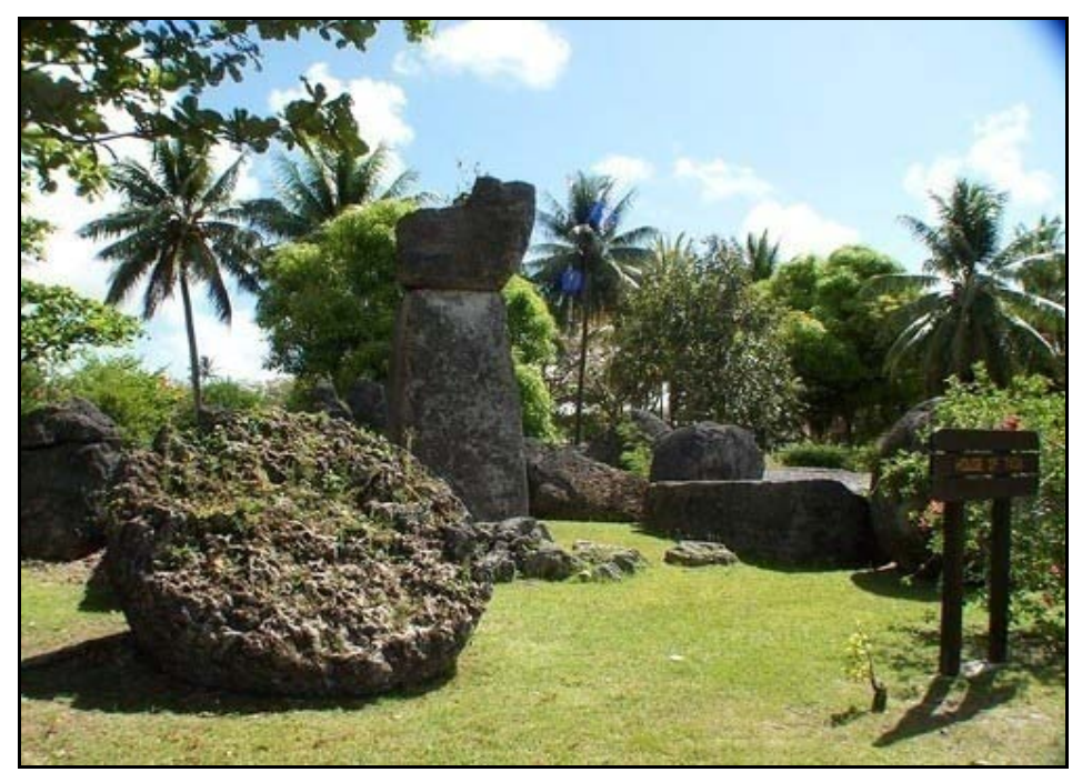
Figure 13.1-15. The Remnants of the House of Taga