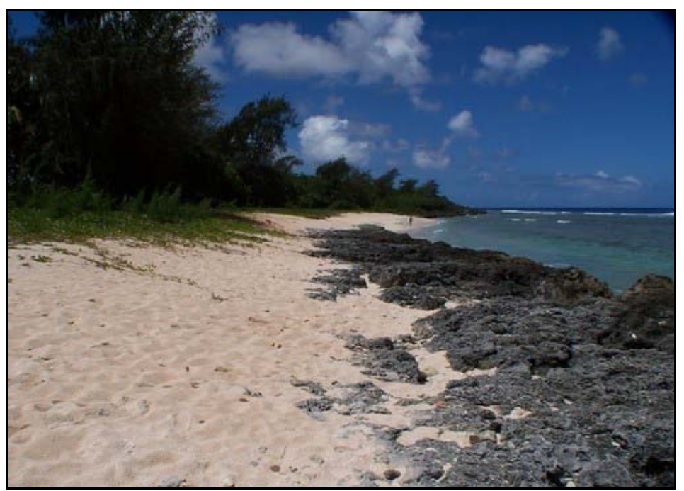
Figure 13.1-11. Chulu Beach

Chulu Beach is about 1.5 miles (mi) (2.4 kilometers [km]) away from the Atomic Bomb Pits on the northwestern shoreline. This is the leeward (western) side of the island and is therefore less windswept with thicker and taller vegetation. Chulu Beach consists of white sand and volcanic rocks offering an overlook to the Philippine Sea, also known as "Star Beach" named after the shape of the sand in this area. View of Chulu Beach is shown in Figure 13.1-11.