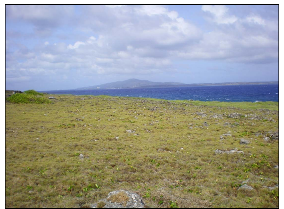
Figure 13.1-5. View from Northeastern Tinian Looking North Toward Saipan in the Distance