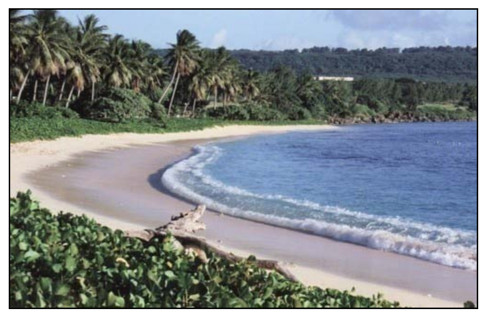
Figure 13.1-17. Kammer Beach

Both Kammer Beach and Taga Beach are located on the southwestern side of Tinian facing the Philippine Sea (Figure 13.1-17 and Figure 13.1-18). Taga Beach is about 1 mile away from Kammer Beach to the south. Both white-sand beaches are surrounded by native vegetation. Aguijan Island, to the south, can be seen from both Taga Beach and Kammer Beach.