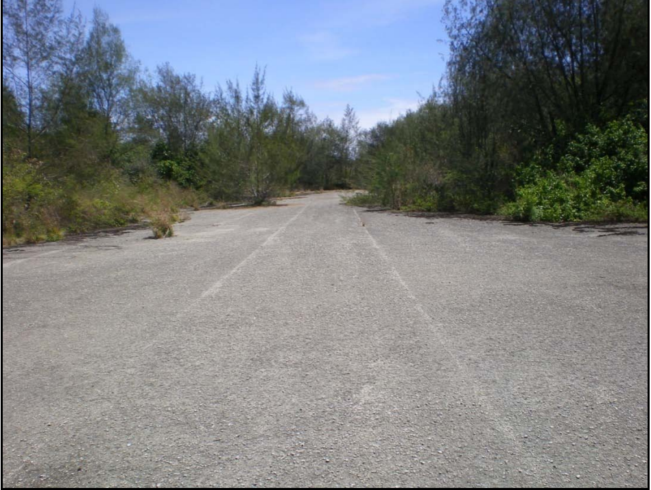
Figure 13.1-4. View of Degraded Airfield and Overgrown Vegetation