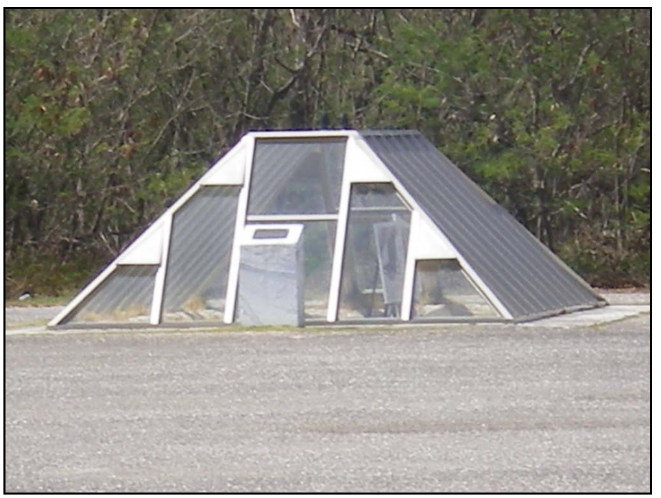
Figure 13.1-8. National Historic Landmark Marker and Bomb Pit Enclosure