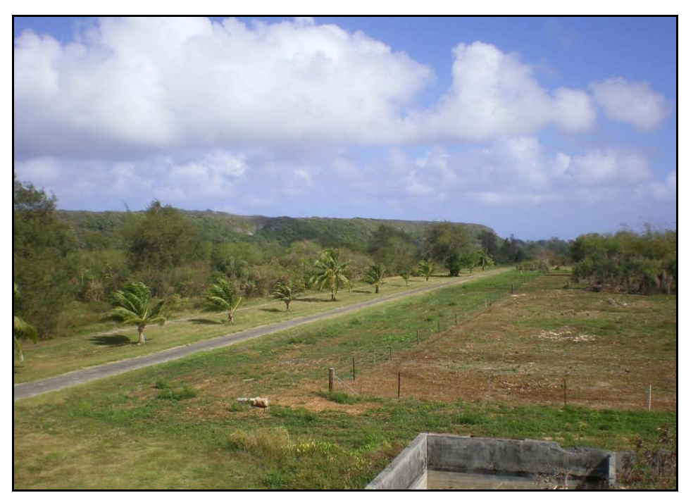
Figure 13.1-13. A View of Broadway in Central Tinian with Agricultural Lands (Cattle) to the Right and the Carolinas Plateau in the Background