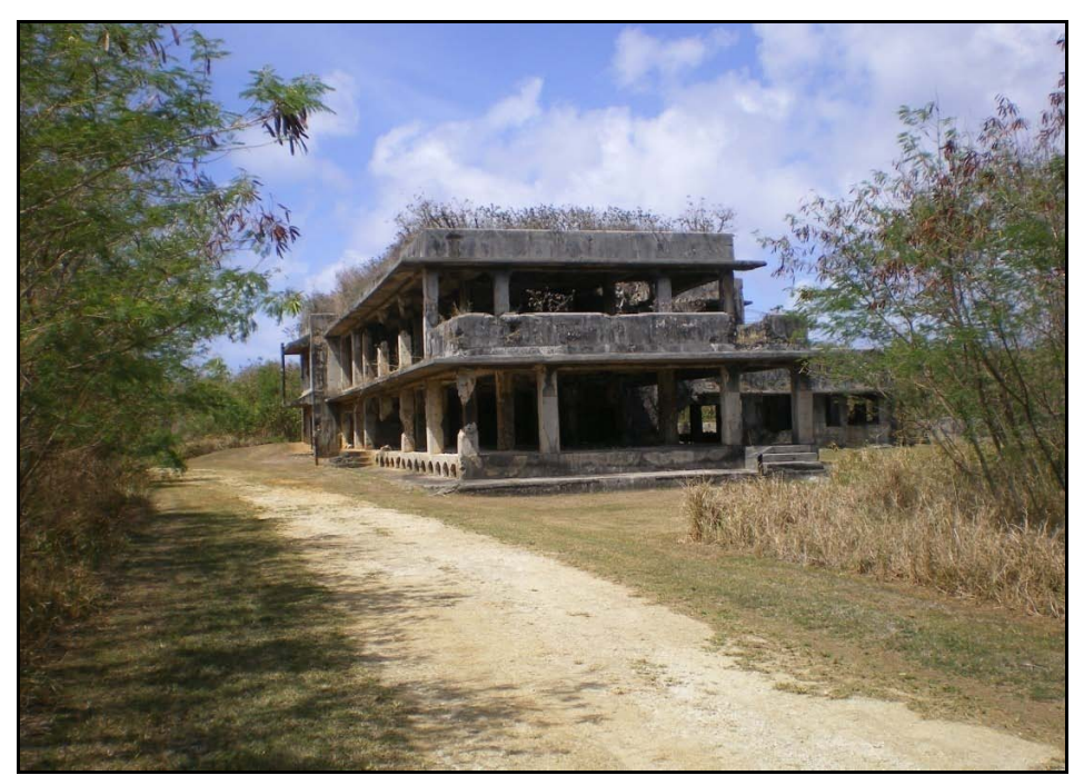
Figure 13.1-9. Ushi Airfield Japanese Air Command Post