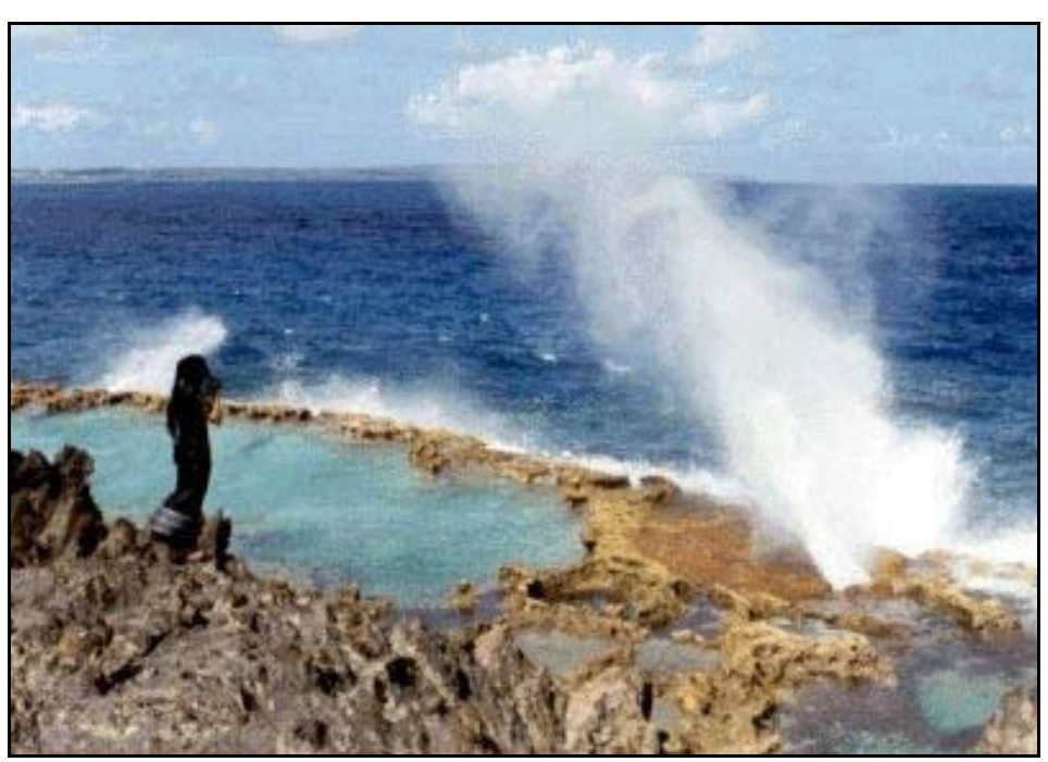
Figure 13.1-10. Tinian Blowhole with Saipan in the Distance

The Tinian Blowhole is located on the northeastern side of Tinian and is a well visited scenic viewpoint. The primary aesthetic value of this area is of seawater pushed through a basalt cave along the shoreline that forces seawater high into the air. As shown in Figure 13.1-10, this coastal feature forms the foreground, the rugged coastline green/blue water composes the middle-ground, and Saipan in the distance makes up the background to a highly valued scenic vista.