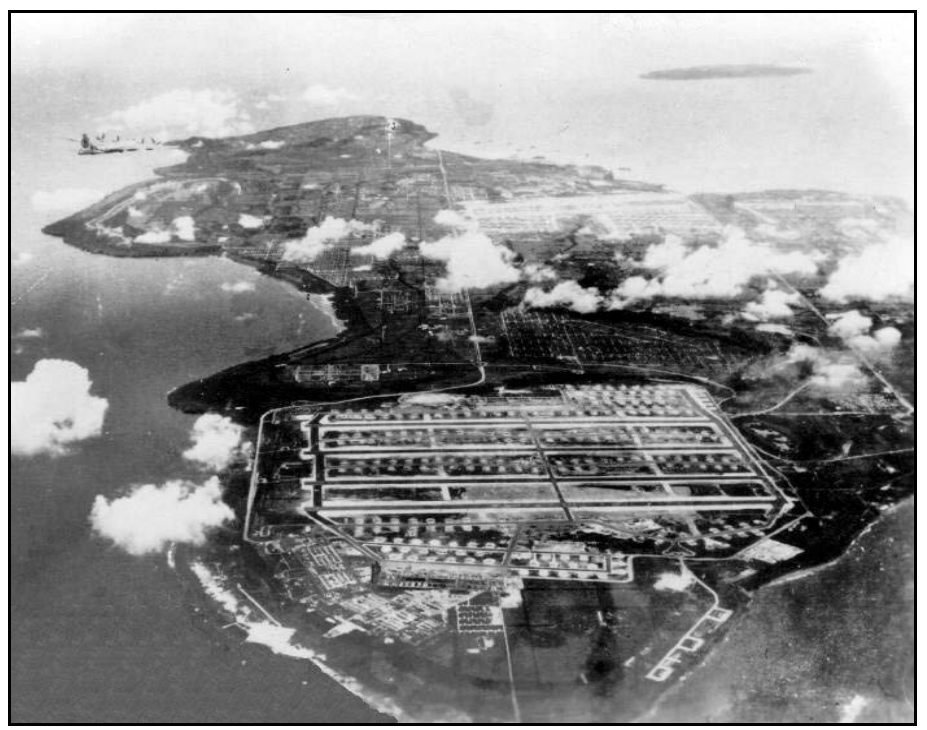
Figure 13.1-1. Aerial View of Northern Tinian Photographed During WWII Photo Taken from the Northern end of Tinian looking South