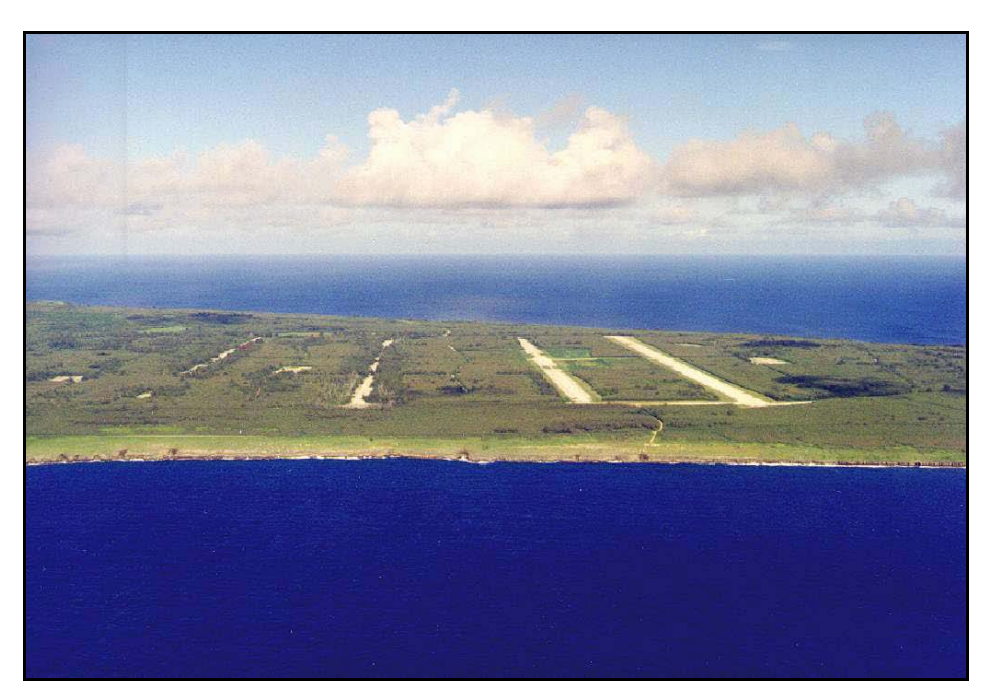
Figure 13.1-3. A Current Aerial View of Northern Tinian; Most of the Airfield has been Overgrown by Vegetation; Photo Taken from East of Tinian Looking West Across North Field

North Tinian, the area defined by the Exclusive Military Use Area, is primarily composed of previously developed and disturbed lands, with old runways extended from east to west (Figure 13.1-3). Today, northern Tinian is mostly dominated by overgrown vegetation carpeting the once open airfield. As shown in Figure 13.1-4, current views from within the northern area are generally short range of the overgrown vegetation, degraded runways and taxiways, old bunkers and other structures. Both the north and northeast coastlines are covered with low, windblown vegetation and generally afford open and expansive views (Figure 13.1-5).